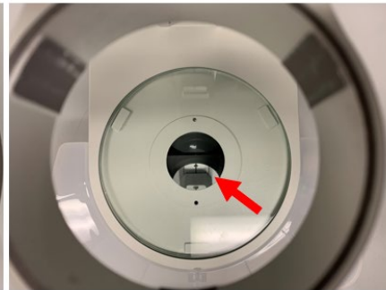
Polished mirror side