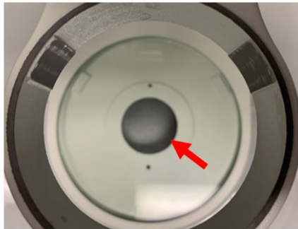
Silver metallic side (frosted)