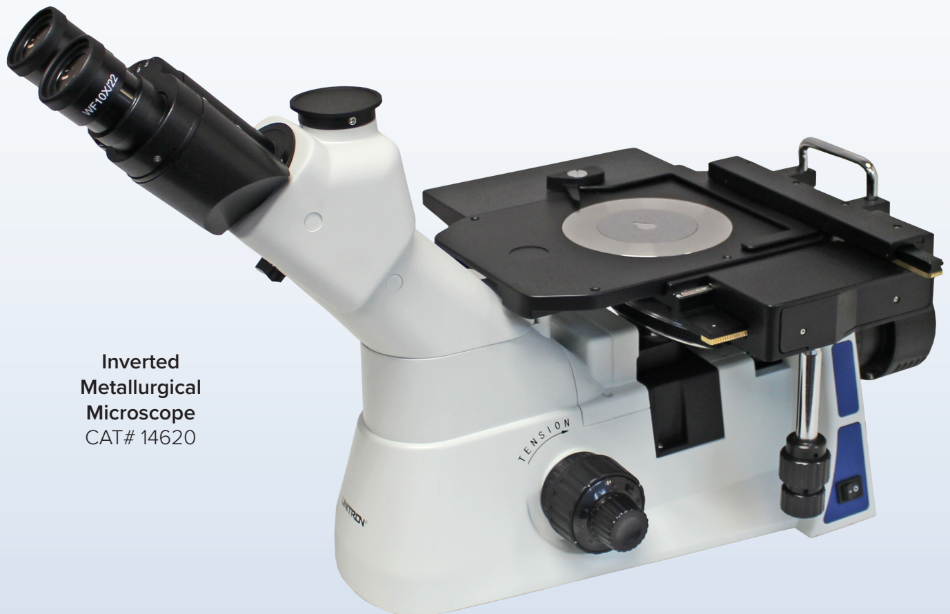
Inverted Metallurgical Microscope CAT# 14620

Designed for the examination and analysis of metallurgical samples and prepared material for automotive, aerospace, and medical device industries.