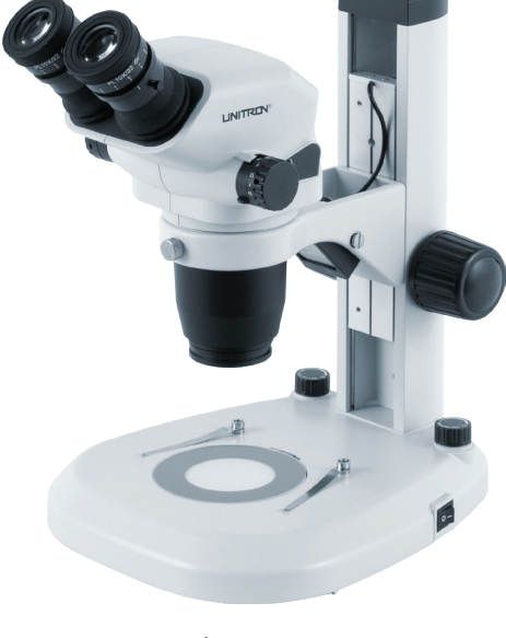
Z645 with LED stand and integrated LED illumination (CAT# 13501)

A wide range of stands and illumination options are available to meet the needs of any application. UNITRON offers plain focusing stands, LED stands, boom stands, articulating (flex) arm stands, pole stands, diascopic illumination stands, plus a variety of LED ring lights and fiber optic illuminators.