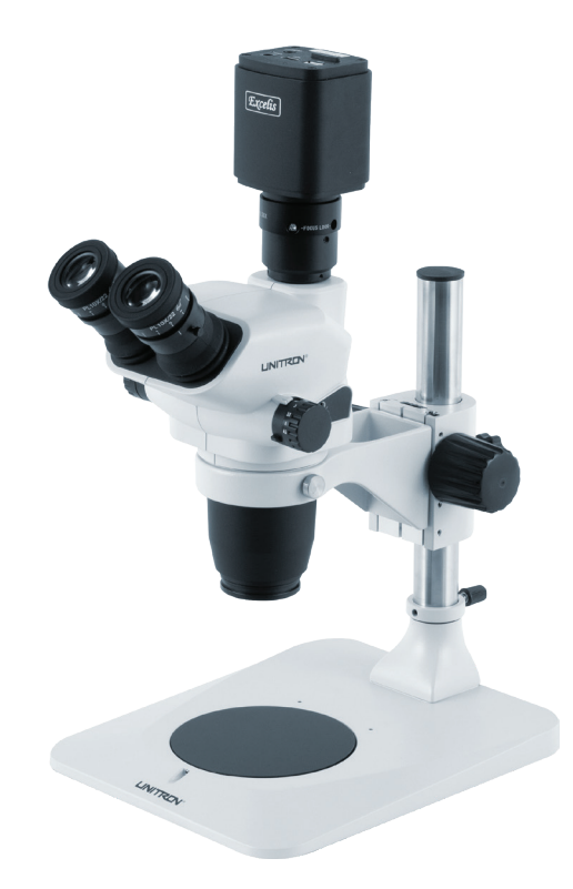
Trinocular Z645 with pole stand (CAT# 13534) and Excelis™ HD camera (CAT# AU- 600-HD)