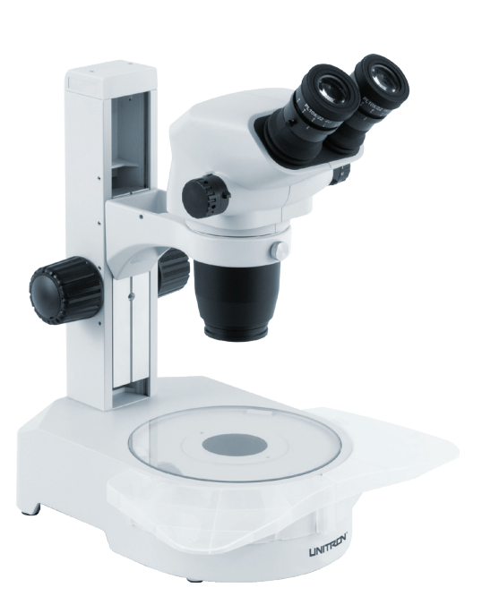
Z645 with diascopic stand and integrated LED illumination (CAT# 13510)